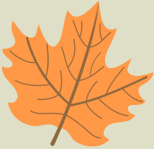
An orange leaf

Get ready to explore the outdoors and discover the beauty of the fall season!