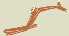
A tree branch